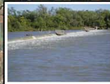
Outlet Weir at Platte River