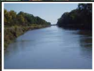
Upper Power Canal